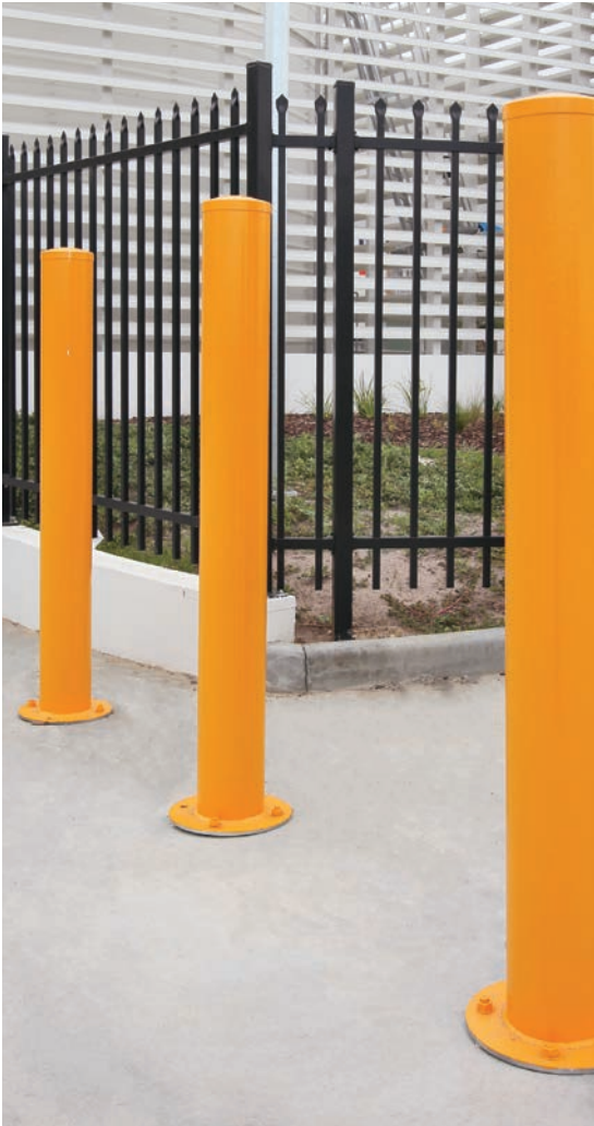
Car Park Safety

Classic Tredfx SH10N Classic Tredfx PT30