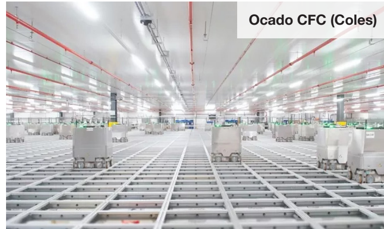
Ocado CFC (Coles)