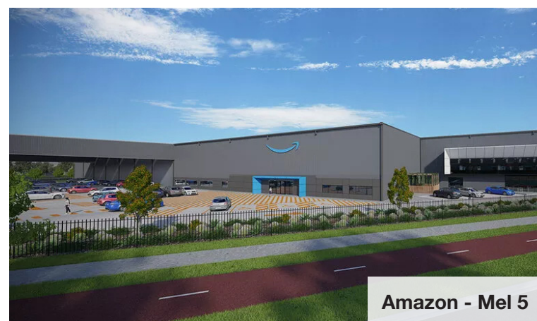
Amazon - Mel 5