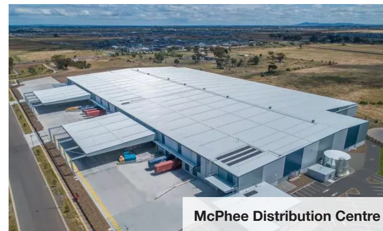
McPhee Distribution Centre