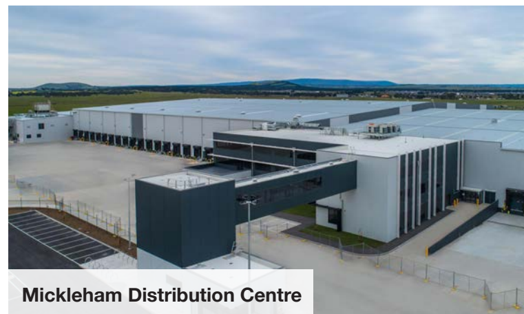
Mickleham Distribution Centre