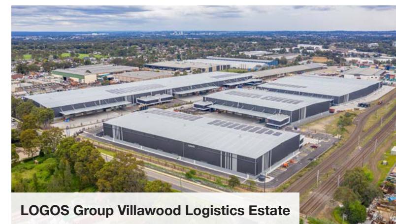
LOGOS Group Villawood Logistics Estate