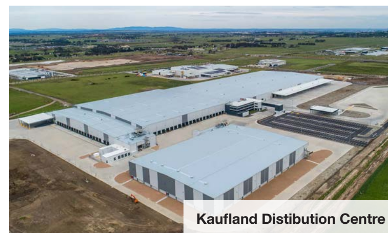
Kaufland Distribution Centre