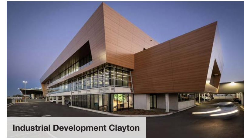
Industrial Development Clayton