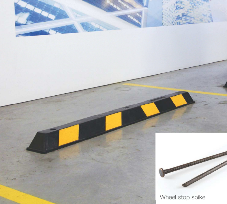
Wheel stop spike